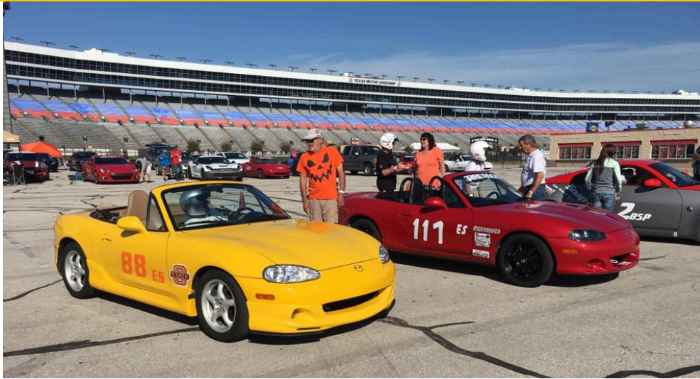
We followed a great battle in E-Street (Above)